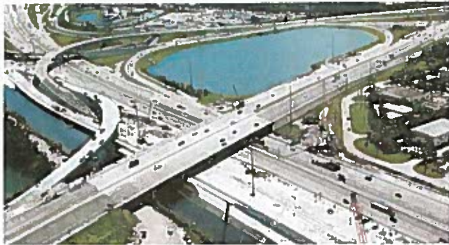
Broward County, Florida's I-595 design-build project is scheduled for completion in 2013.